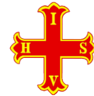
Symbol of the Order of the Red Cross of Constantine