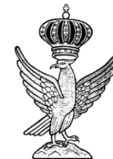
Symbol of the Order of St John the Evangelist